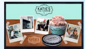
media display monitor